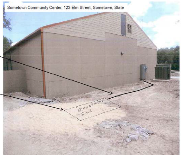
Figure 4. Ground-level photograph showing proposed ground disturbance area.