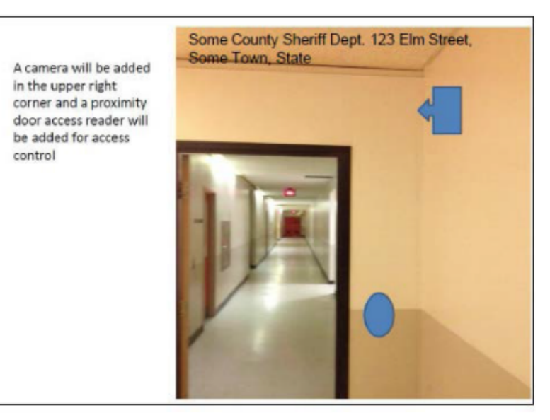
Figure 6. Interior photograph showing proposed location of new equipment.

Figure 3. Ground-level photograph with graphic showing proposed equipment installation.