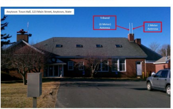
Figure 2. Example of ground-level photograph showing proposed attachment of new equipment.

Ground-level photographs. The groundlevel photograph in Figure 2 supplements the aerial photograph in Figure 1, above. Combined, they provide a clear understanding of the scope of the project. This photograph has the name and address of the project site, and uses graphics to illustrate where equipment will be installed.